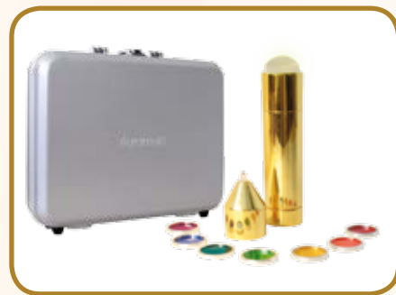
Penlight Set Elite gold Item No. 3020 (24 carat gold-plated)