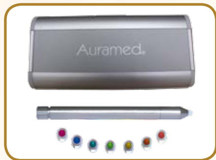
Penlight Set Basic 2 Item No. 3040 (chrome coloured)