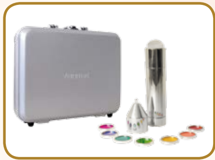
Penlight Set Elite silver Item No. 3030 (glossy, silver-chrome coloured)